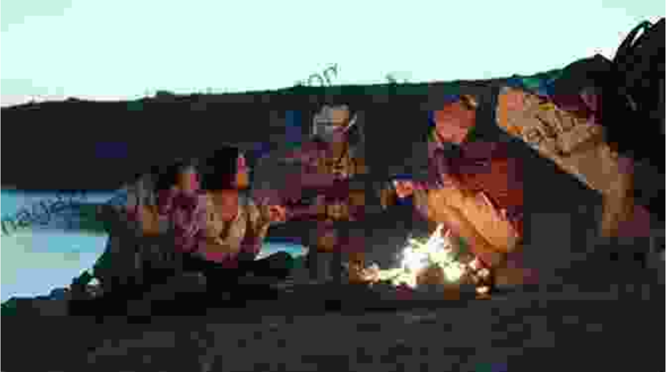
German soldiers singing "Lili Marlene" during World War II

And there were songs that captured the hopes and dreams of those who were waiting at home, such as "I'll Be Home for Christmas" and "We'll Meet Again."