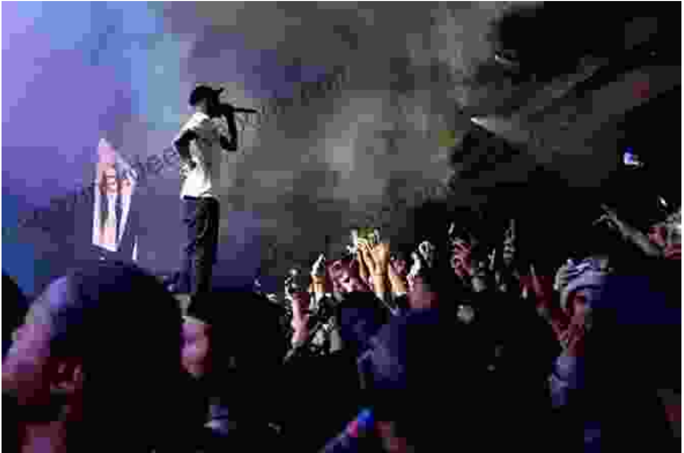
Rap artist performing live

Rap is a genre of hip hop music that involves speaking or rhyming words over a beat or instrumental. Rap evolved in the 1980s and has since become one of the most popular music genres worldwide. Rap artists often use their lyrics to express themselves, address social issues, and tell stories.