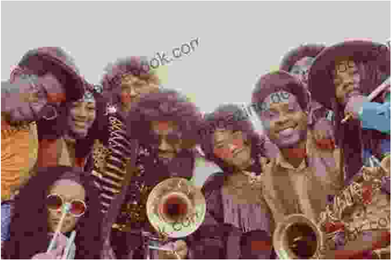
Funk band performing live

Funk emerged in the 1960s as a fusion of soul, jazz, and rhythm and blues. Funk music is characterized by its heavy basslines, syncopated rhythms, and catchy melodies. Funk musicians often used improvisation and experimentation to create unique and energetic soundscapes.