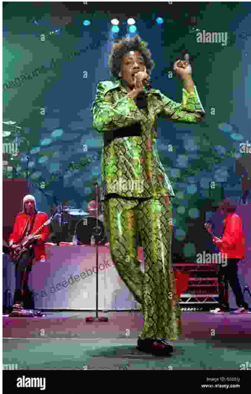
Soul singer performing on stage

Soul music emerged in the 1950s as a combination of R&B, gospel, and pop music. Soul music is characterized by its emotional lyrics, passionate vocals, and soaring melodies. Soul music has had a significant impact on popular culture, inspiring countless artists and captivating audiences worldwide.